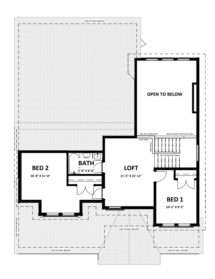
Second 638 sq.ft.