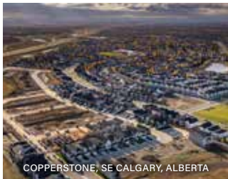
COPPERSTONE, SE CALGARY, ALBERTA