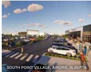
SOUTH POINT VILLAGE, AIRDRIE, ALBERTA