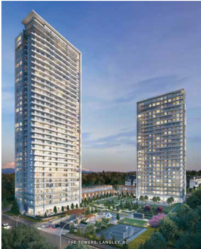
THE TOWERS, LANGLEY, BC