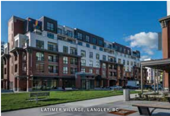
LATIMER VILLAGE, LANGLEY, BC