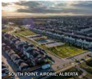
SOUTH POINT, AIRDRIE, ALBERTA