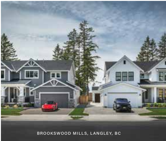
BROOKSWOOD MILLS, LANGLEY, BC