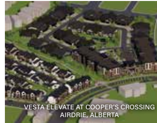
VESTA ELEVATE AT COOPER'S CROSSING AIRDRIE, ALBERTA