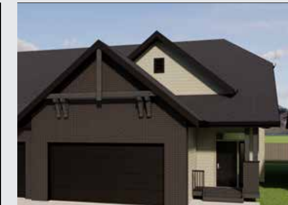
ACADIA VILLAS AT COOPER'S CROSSING