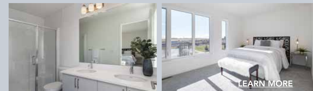
3 Beds | 2.5 Baths | 1,592 to 1,717 sq. ft. 777 to 836 sq. ft. of unfinished basement