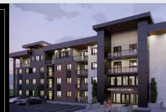
MONARCH AT COOPER'S CROSSING