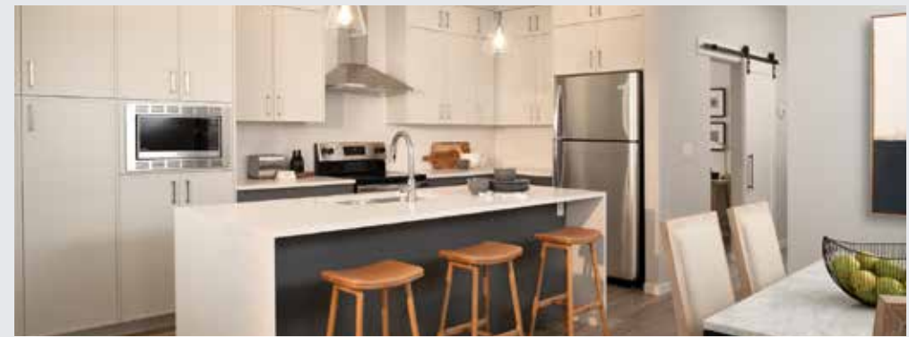
SINGLE FAMILY LANE HOMES