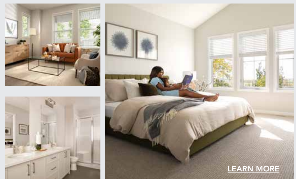
3 Beds + Office | 3 Baths | 1,735 to 1,867 sq. ft. Approx 800 sq. ft. Unfinished Basement

For more information on individual homes styles and floorplans, visit VESTASOUTHPOINT.COM