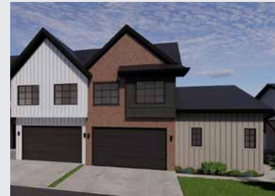
BRIMSTONE TOWNHOMES AT COOPER'S CROSSING