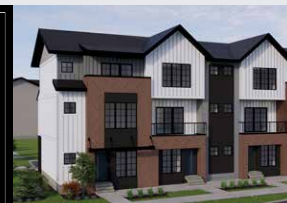
VILLAGE TOWNHOMES AT COOPER'S CROSSING

SPACIOUS OUTDOOR DECK SPACE WITH ADDED BALCONY