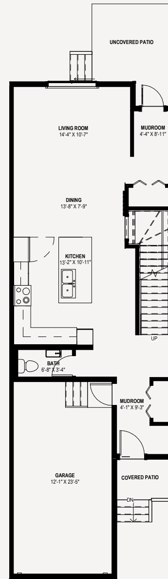
MAIN 789 SQ. FT.