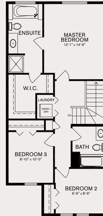
SECOND 758 SQ FT