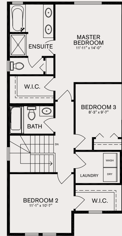
SECOND 794 SQ FT