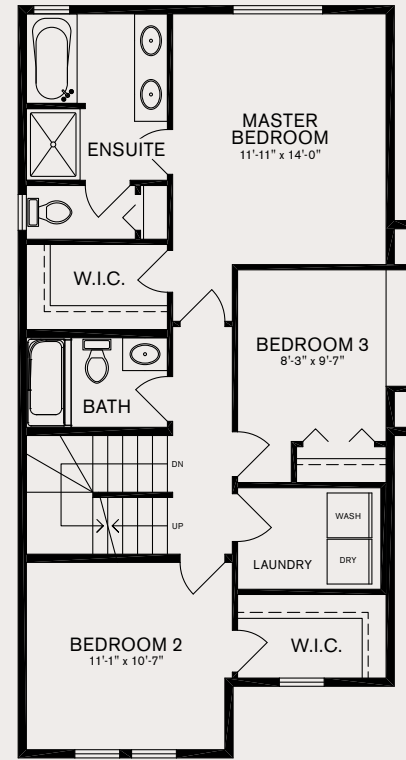
SECOND 846 SQ FT